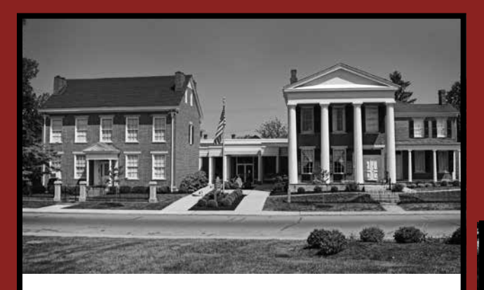
ROSS COUNTY HERITAGE CENTER 45 West Fifth Street, Chillicothe Open: 12 pm -4 pm

Special exhibit of original Ohio statehood documents including Thomas Worthington's personal draft of the 1802 Ohio Enabling Act.